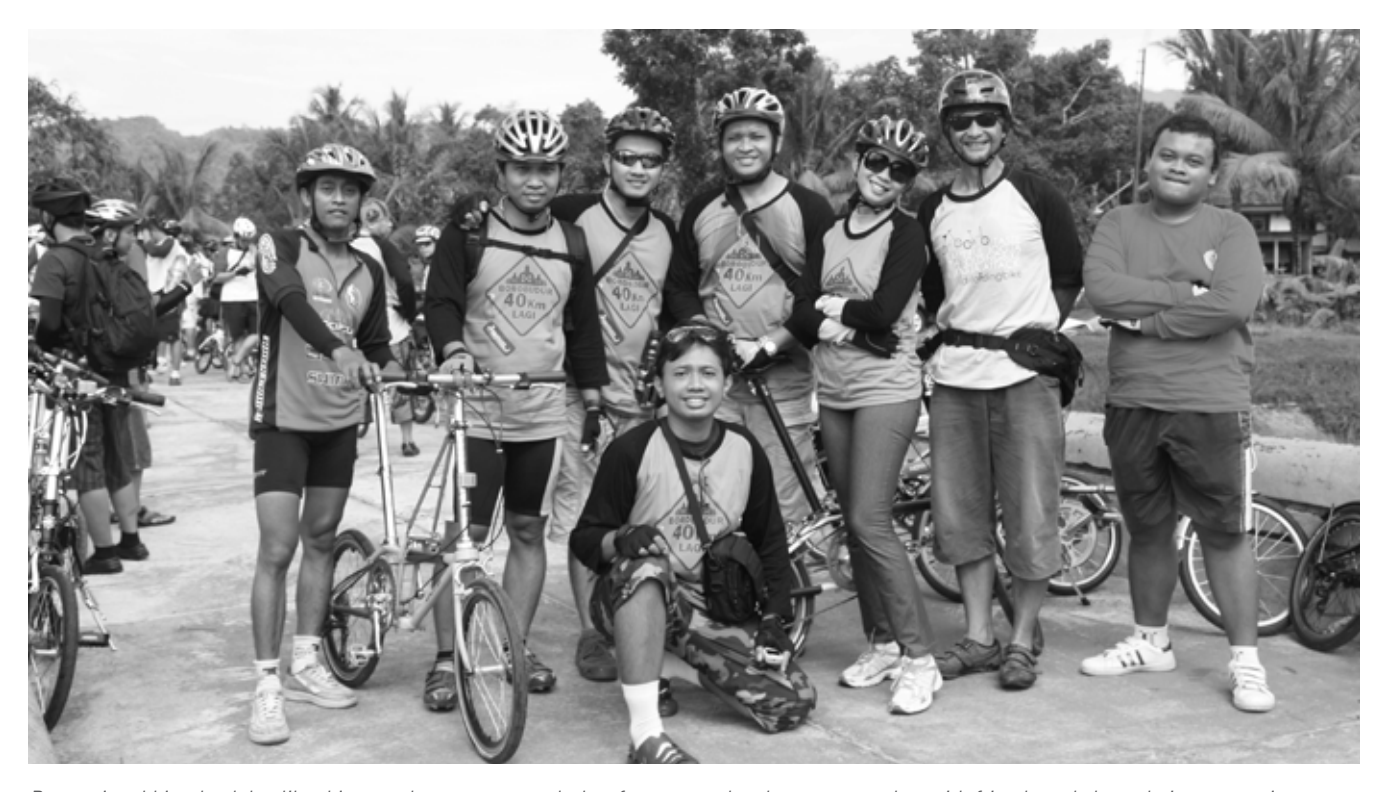
Recreational bicycle clubs, like this one above, meet regularly, often on weekends to get together with friends and share their common interest in cycling.

Commonly known as onthel communities, bike collectives such as Bike2Work and Seli Solo Raya have popularized cycling as a fun, sustainable and convenient mode of transportation. They have developed social and recreational programs, city wide cycling events, and educational and awareness campaigns, among others. They are ideal partners in developing and promoting a new vision for cycling in Solo.