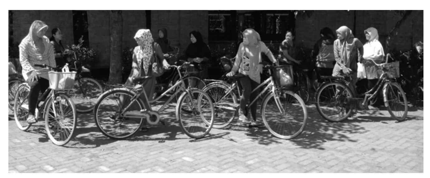
Solo is a city known for its many tobacco, textile and plastic factories, the majority of workers are women. While many ride bicycles the trend indicates many are changing to motorcycles.

In recent times, conditions have changed. Factory authorities have abandoned incentives for biking to work. Furthermore, facing a heavy chore burden in their homes and increasing motorization, many women are discouraged with the time and effort required to cycle. To better understand these conditions, we held several discussions with factory workers and leaders. These conversations, complemented by field observations, influenced the formulation of solutions that aim to preserve and strengthen a long-lived tradition for sustainable transportation.